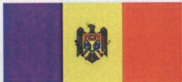
REPUBLIC OF MOLDOVA